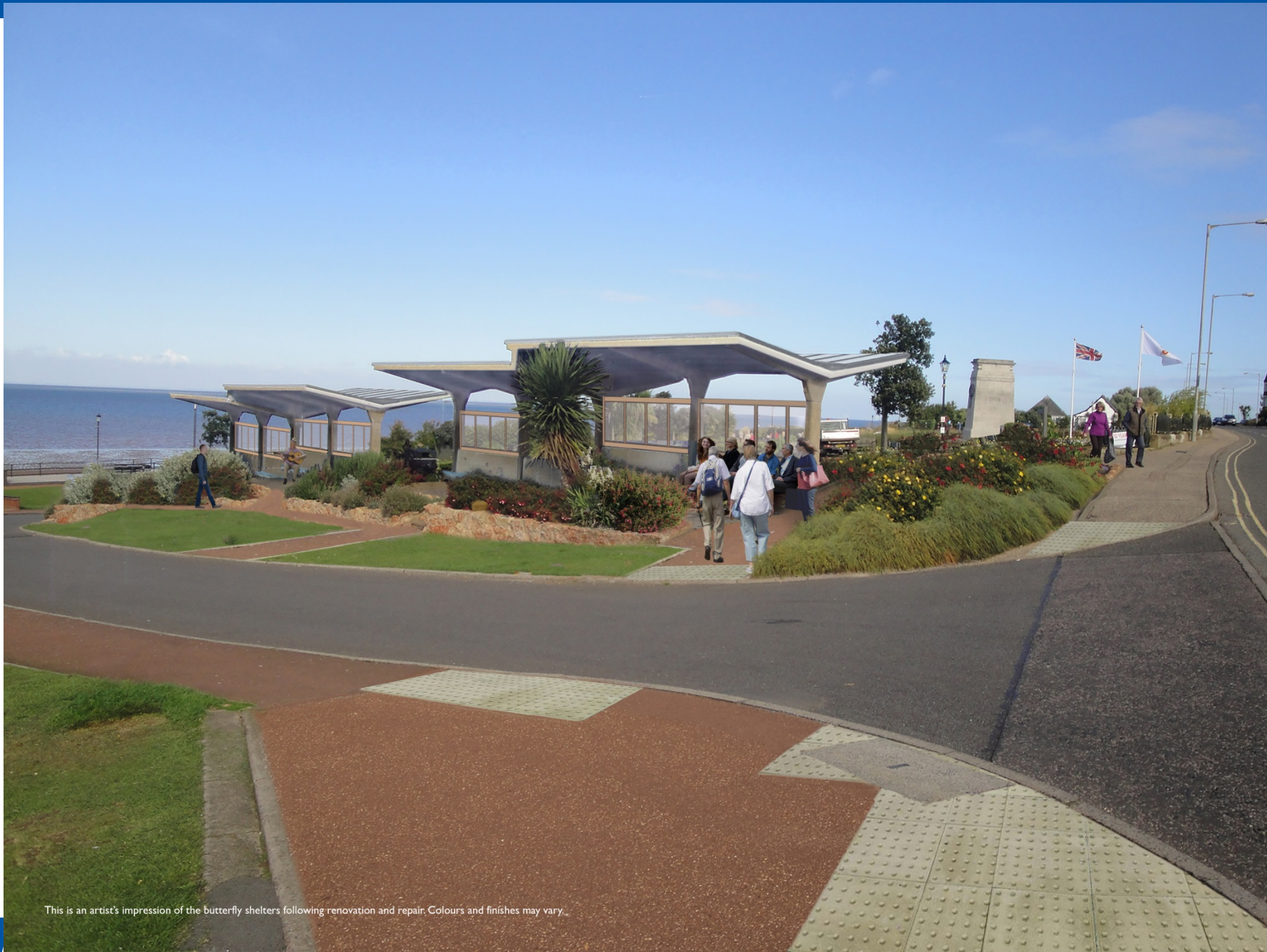
This is an artist's impression of the butterfly shelters following renovation and repair. Colours and finishes may vary.